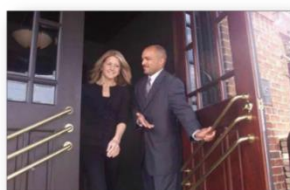
(Men) open the door for ladies

Make sentences by matching the pictures, modal verbs and their functions.