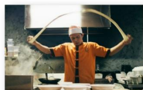
(Chef) make delicious noodles