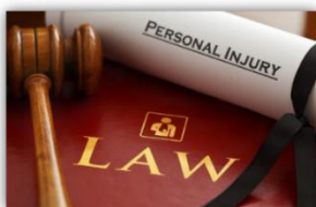
(Citizens) obey the law