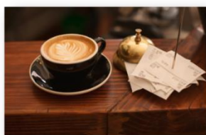
(I) have a cup of coffee?