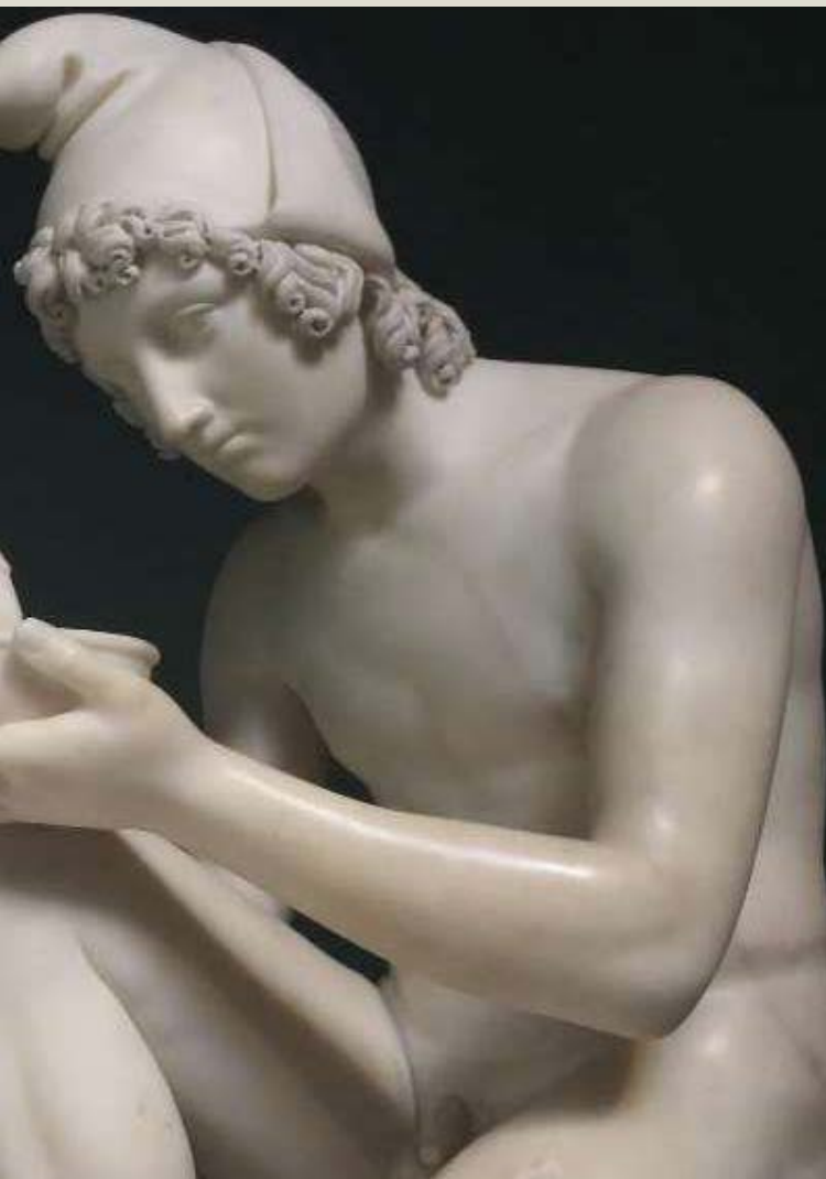
Photograph from Baomu Song, Denmark , Aug., 2018

They are all independent individuals, and their thinking cannot be directly