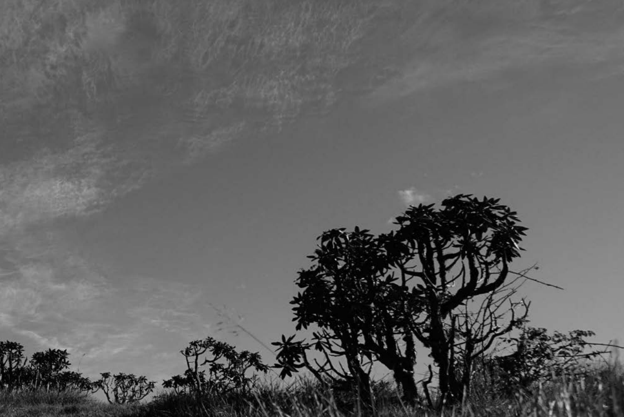
Photograph from Jincheng Yan, Sri Lanka, Jan., 2019

thought connections stopped. Zeus decided to knock down the hammer of judgment and start the quantum black hole system of the Universe Court to capture the energy of the sun.