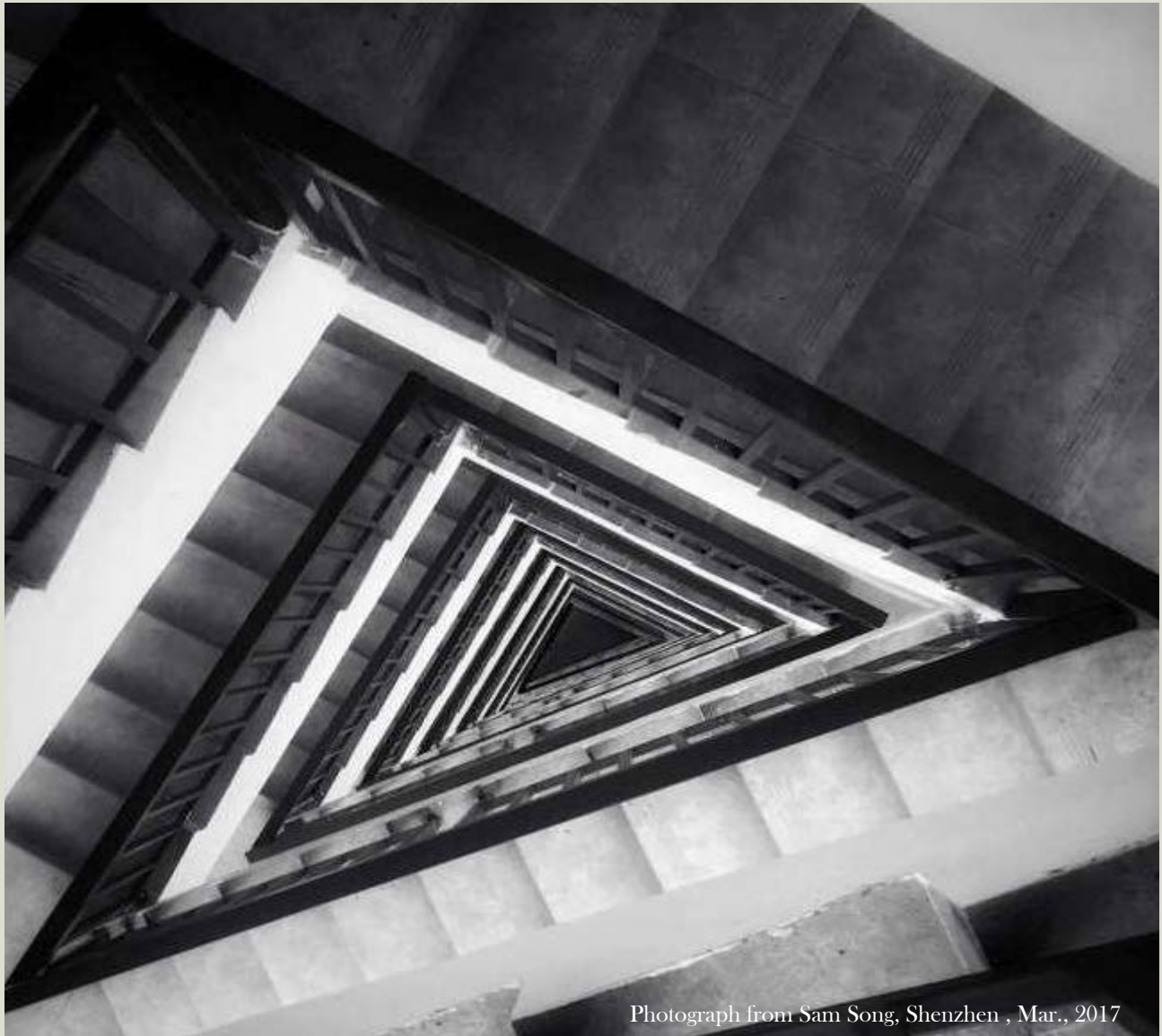
Photograph from Sam Song, Shenzhen , Mar., 2017

In the central region of the Galaxy that about 25,000 light-years from the Earth, the background of the universe likes an endless dark curtain. Once upon a time, there was an outline of a bright silver light spot became clearer and clearer in the darkness of life's forbidden zone in a flash. Soon after, the appearance of light spots became obvious. It is an extremely large standard octahedron, with a side length of 50,000 kilometers. Its surface is made of smooth metallic materials. In the limited cognition of human beings, objects of this shape can never be produced naturally. It's not easy to